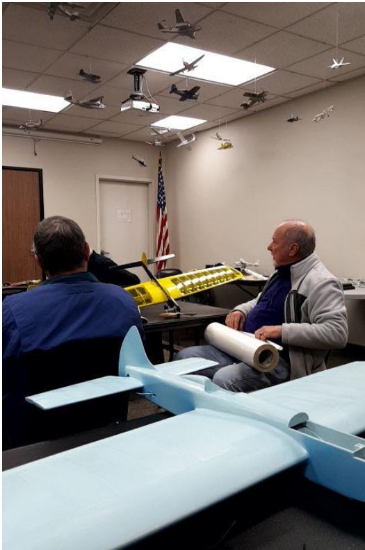
Warren's Humongous/Greg's Lancer

Lessons Learned: We need more Transitrace experience, and be sure to deploy the swimming pool foam plastic noodles as dolly catchers any time you fly within our fenced circle. Howard's B-Dolly suffered damage when it hit the fence hard.